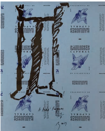
Pierre Buraglio À André Fougeron , 2019 linocut on Gauloises paper 24 x 19,5 cm | 7 ex 450 €