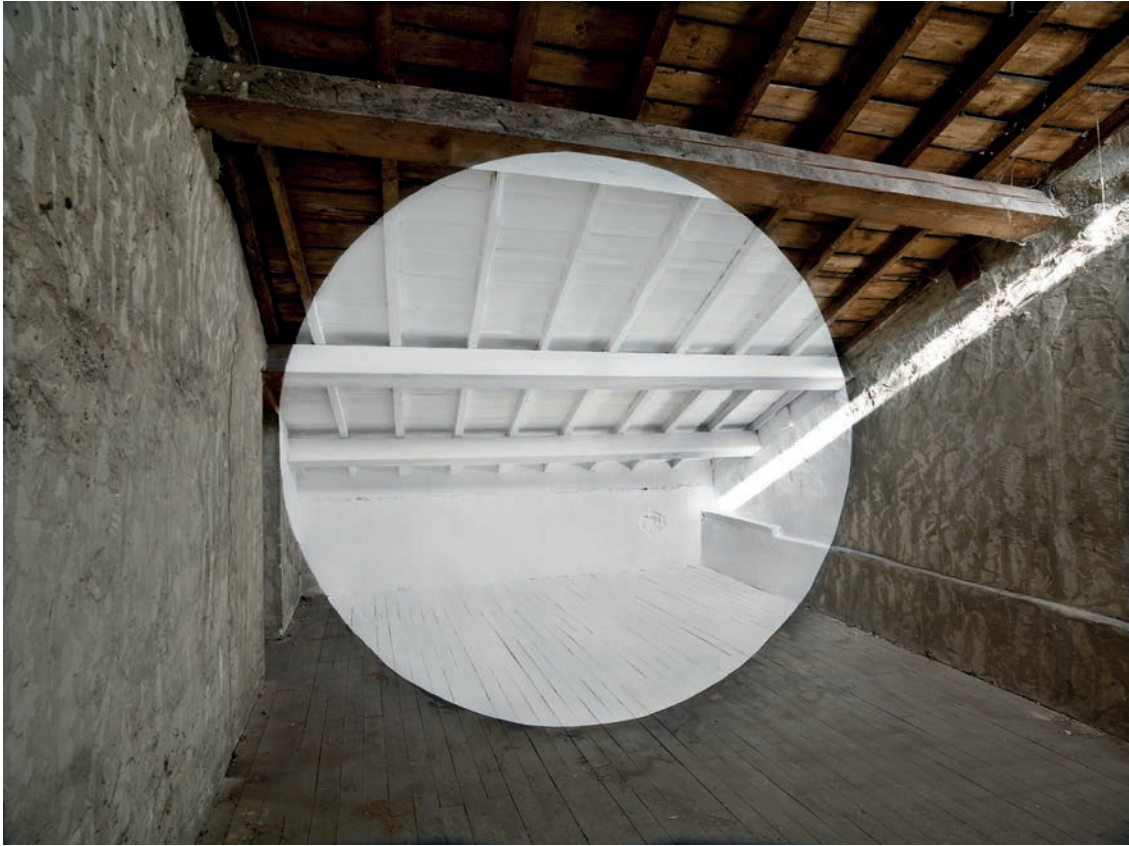
Georges Rousse Bourgoin Jallieu , 2019 inkjet print 92 x 112 cm | 30 ex 3 200 €