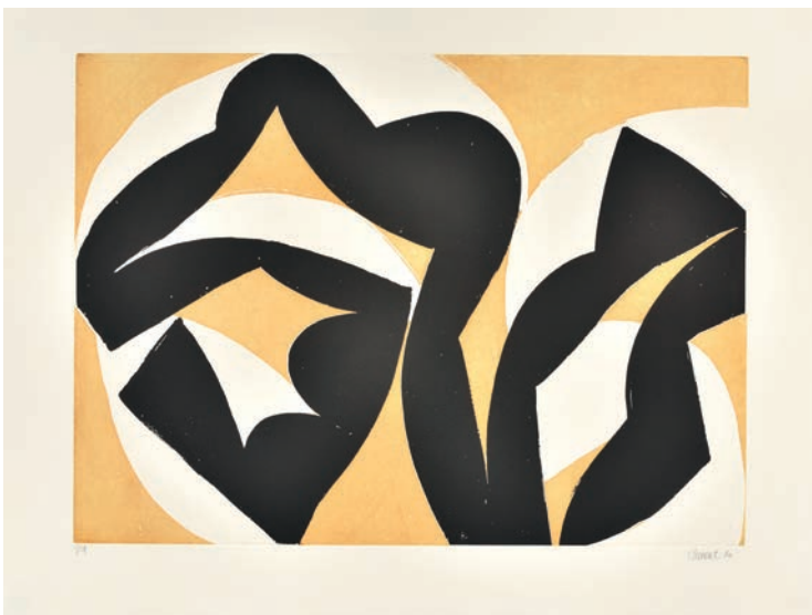
Alain Clément Sans titre , 2020 aquatint 50 x 66,5 cm | 19 ex 600 €