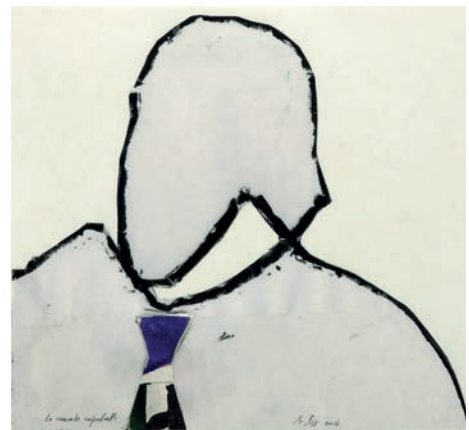
Pierre Buraglio La cravate improbable , 2014 inkjet prints and collage 29,5 x 32 cm | 15 ex 550 €