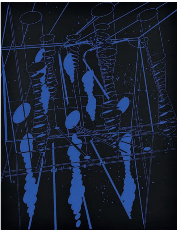
Bernard Moninot Antichambre , 2018 engraving on paper 65 x 50 cm | 15 ex 600 €