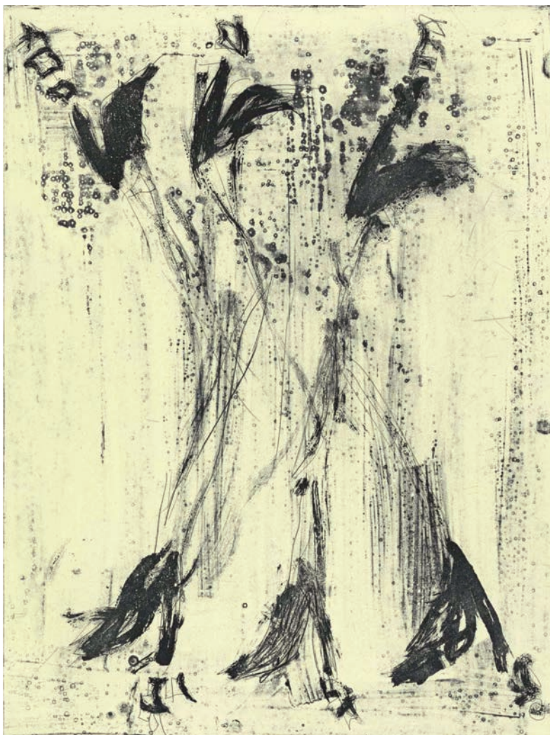
Georg Baselitz Ich höre Stimmen , 2015 etching and aquatint 85,5 x 64,5 cm | 10 ex 5 000 €