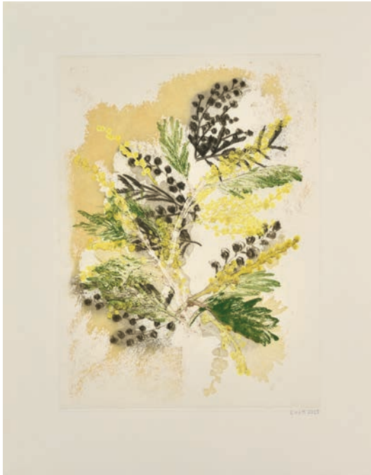
Eloise Van der heyden Mimosa , 2020 monotype 53,8 x 42 cm | 15 variations 900 €