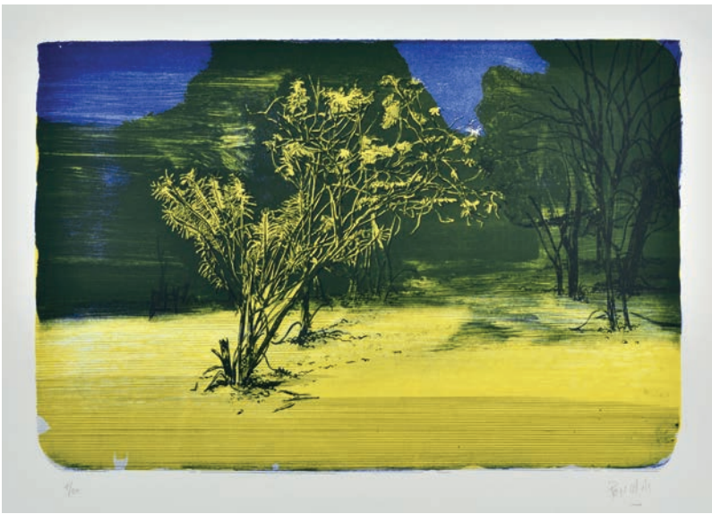
Frédéric Poincelet sans titre , 2017 lithograph 42 x 57,5 cm | 20 ex 400 €