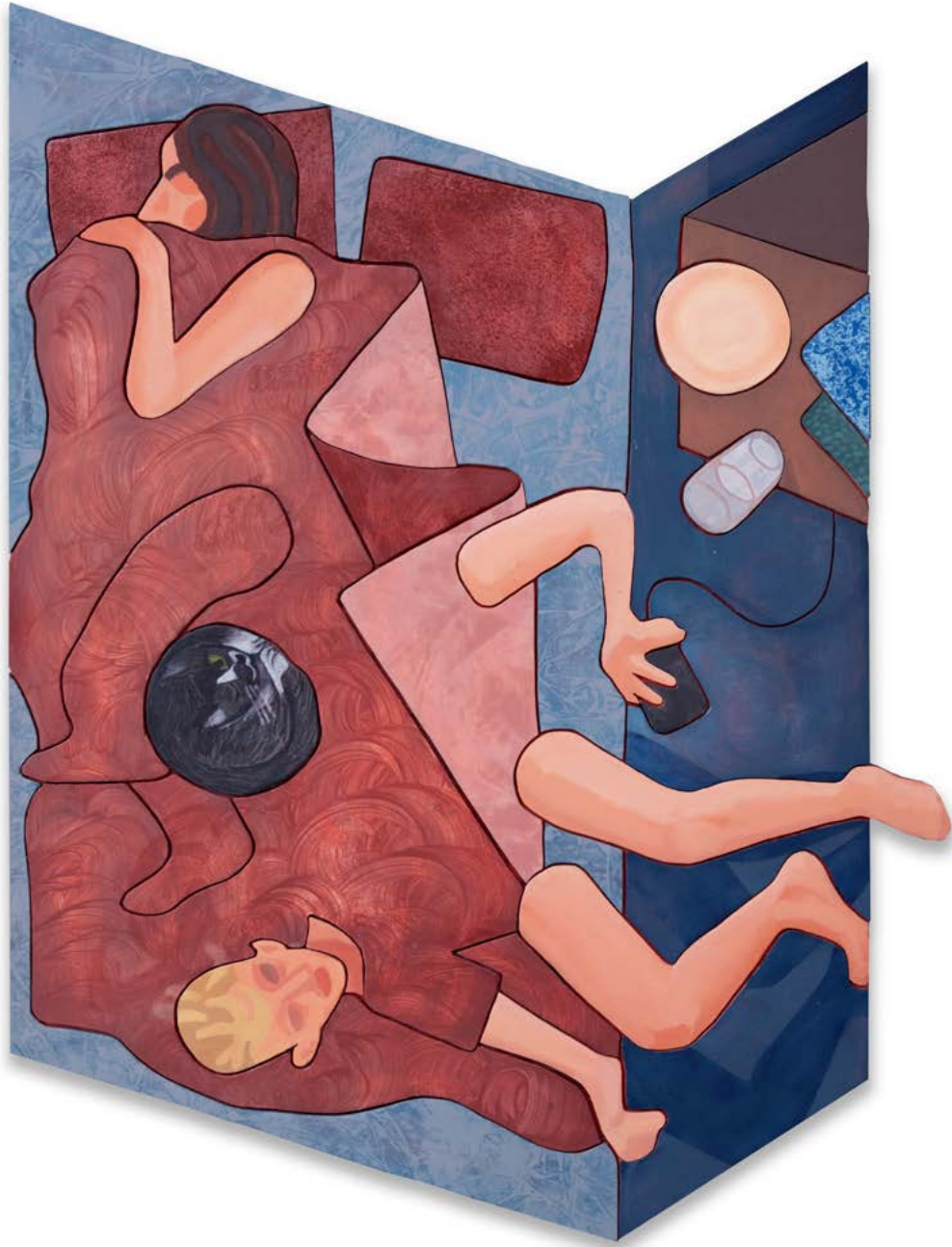
Rob Miles Early In The Morning 2022, oil on cut wood, 60 x 80 cm, Courtesy Galerie Catherine Putman