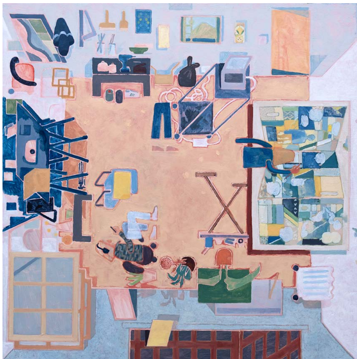
Rob Miles L'atelier de Pierre 2022, oil on wood, 60 x 60 cm, Courtesy Galerie Catherine Putman