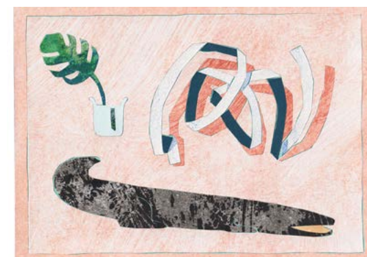
Rob Miles Notes on a crocodile 2022, collage, 15 x 21 cm