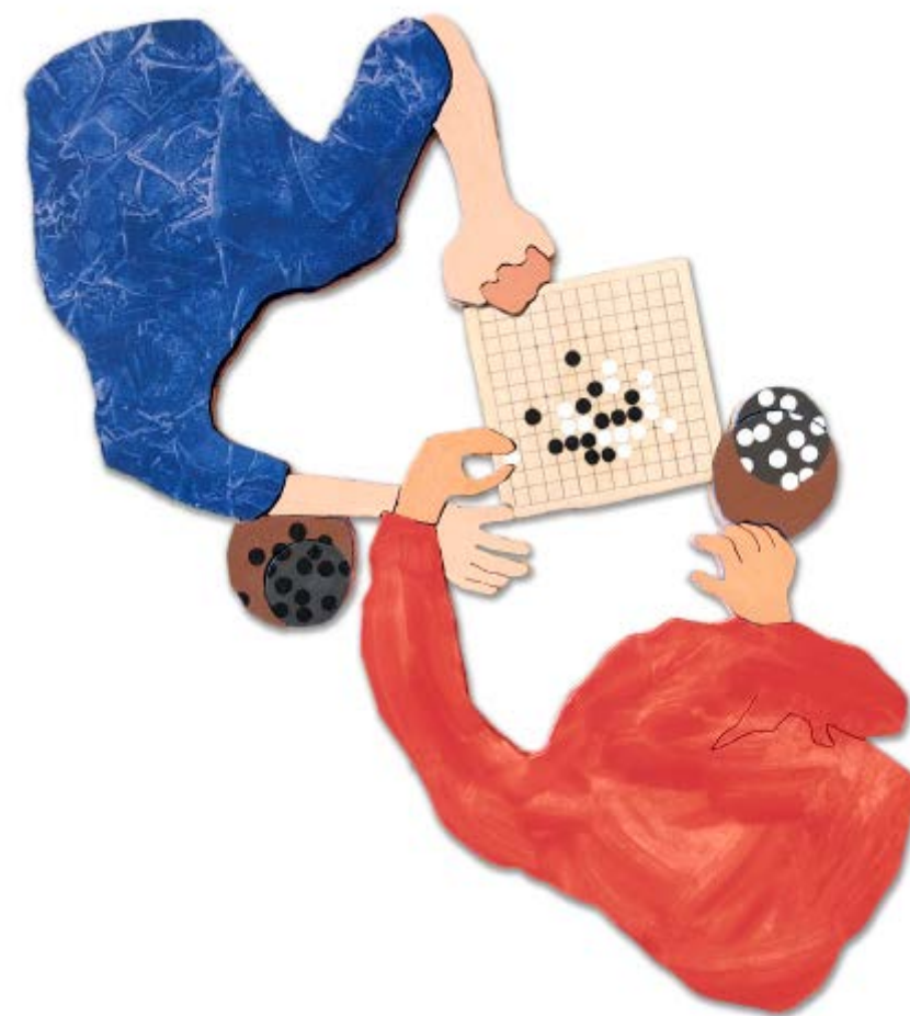
Rob Miles Learning Go 2022, oil on cut wood, 25 x 42 cm