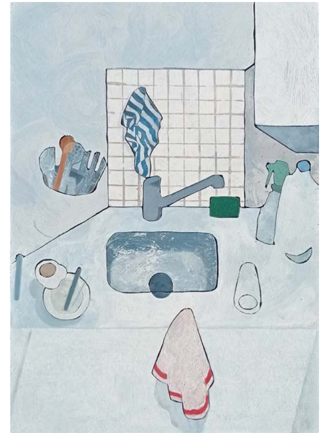
Rob Miles Kitchen in Hyeres 2022, oil on cut wood, 30 x 20 cm, Courtesy Galerie Catherine Putman