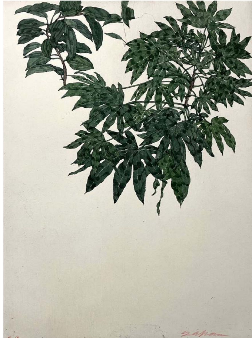
Sam Szafran Sans titre 1990 | etching and watercolour | 42 x 31,5 cm