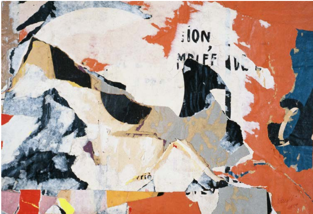
Jacques Villeglé 253 boulevard Raspail , 1959 | ripped posters mounted on canvas | 29 x 42,5 cm | Private collection

40, rue Quincampoix 75004 Paris | 1 er étage T. +33 1 45 55 23 06 | Du mardi au samedi de 14 à 19 heures et sur rendez-vous contact@catherineputman.com | catherineputman.com