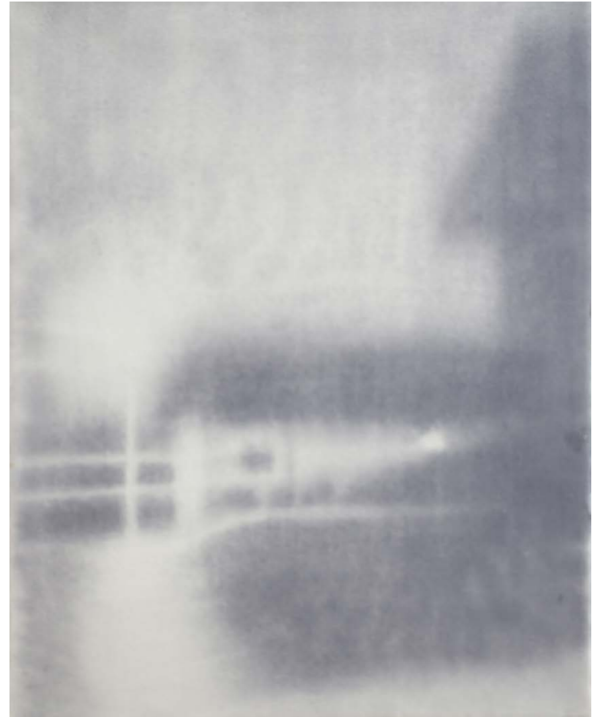
Gildas Le Reste Les paysages français, notes de voyage #2 2023 | ink on paper mounted on canvas | 50 x 40 cm