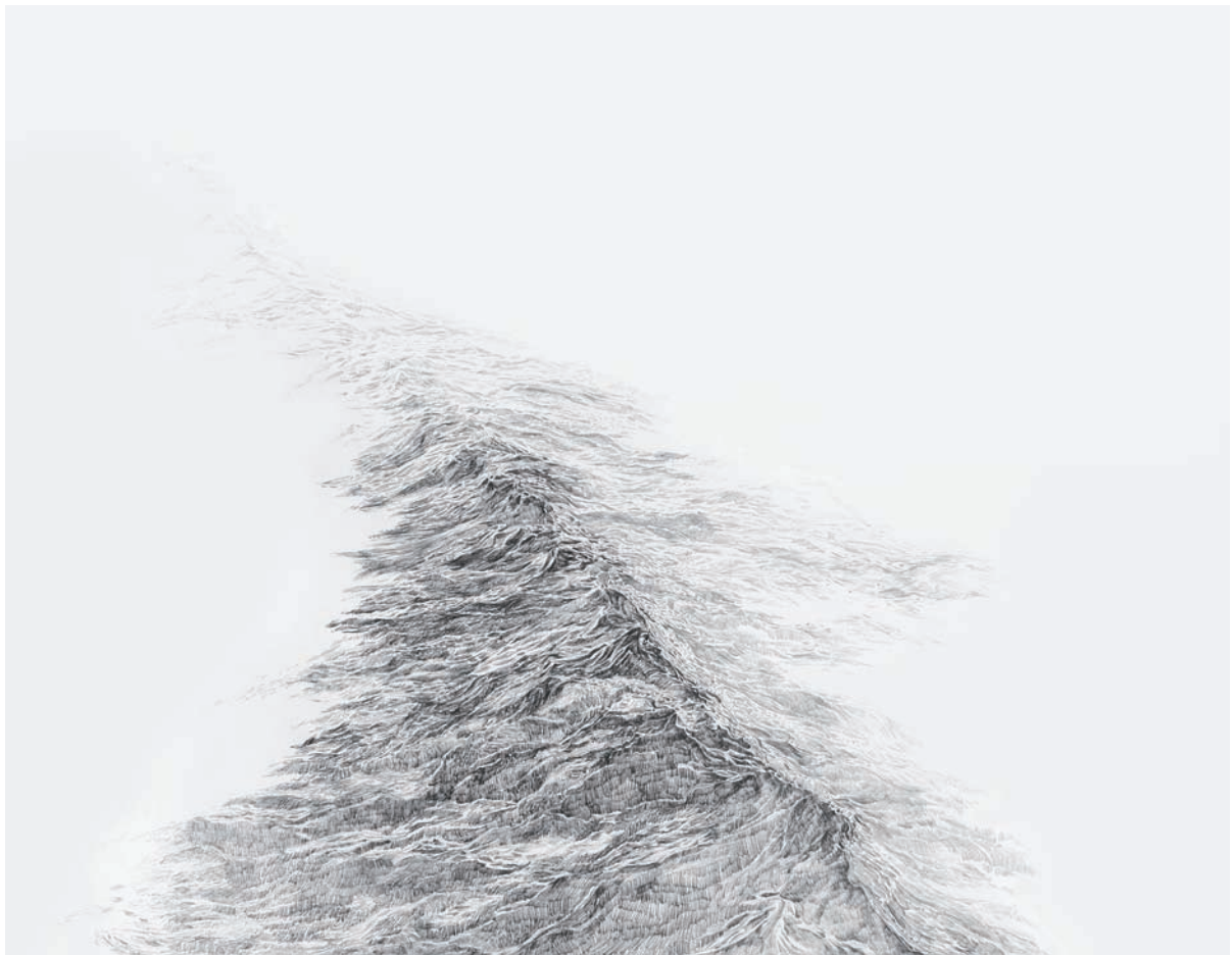
Li Xi «Untitled», 2014 - graphite on paper - 50 x 65 cm