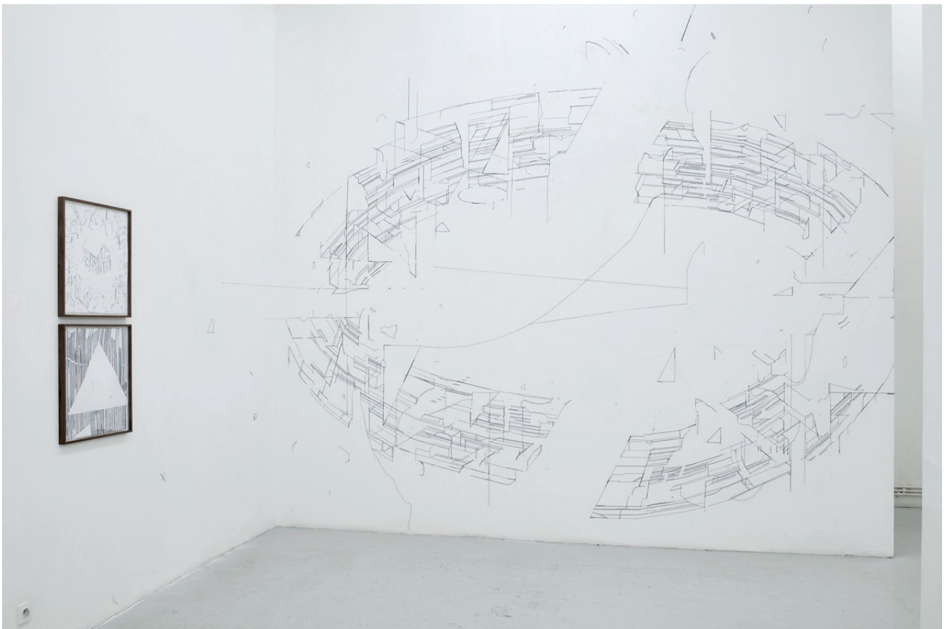
Keita Mori - Bug report (circuit), 2014 –taut wire with a glue gun on the wall, view of the exhibition, «Réal imaginaire», Galerie Jean-Luc Richard, Paris

de 14 à 19 heures, du mardi au samedi & sur rendez-vous 40 rue Quincampoix 75004 Paris | 1er étage | T. +33 (0)1 45 55 23 06 contact@catherineputman.com | www.catherineputman.com