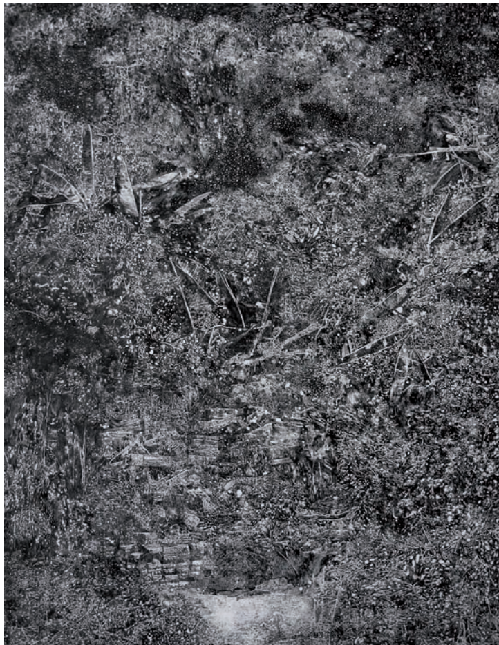
Antonia Kuo «Sans titre», 2014 - graphite on paper mounted on wood - 45 x 35 cm