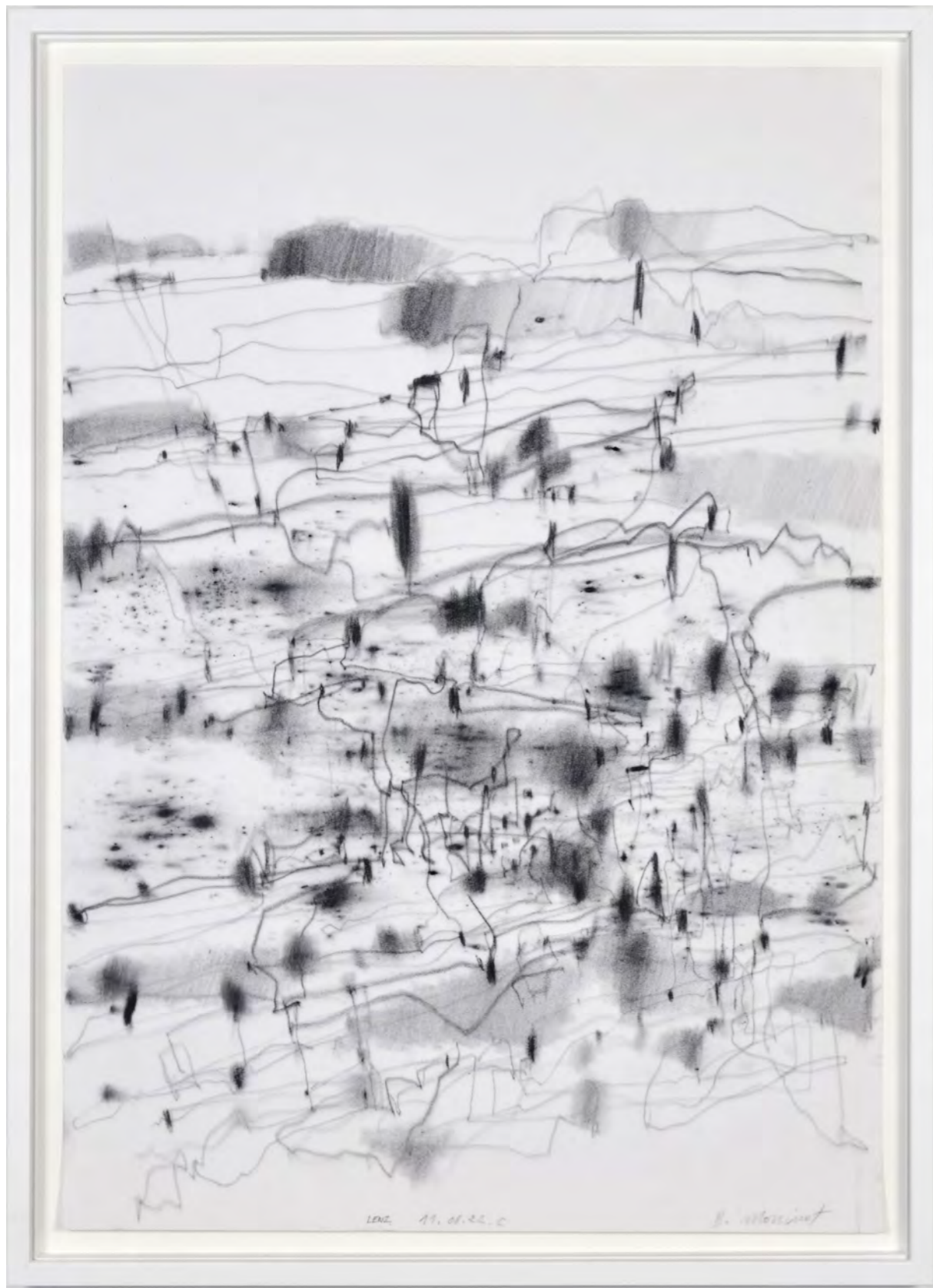
Bernard Moninot Lenz (11.08.22 C) , 2022, graphite on velvet paper, 50 x 35 cm