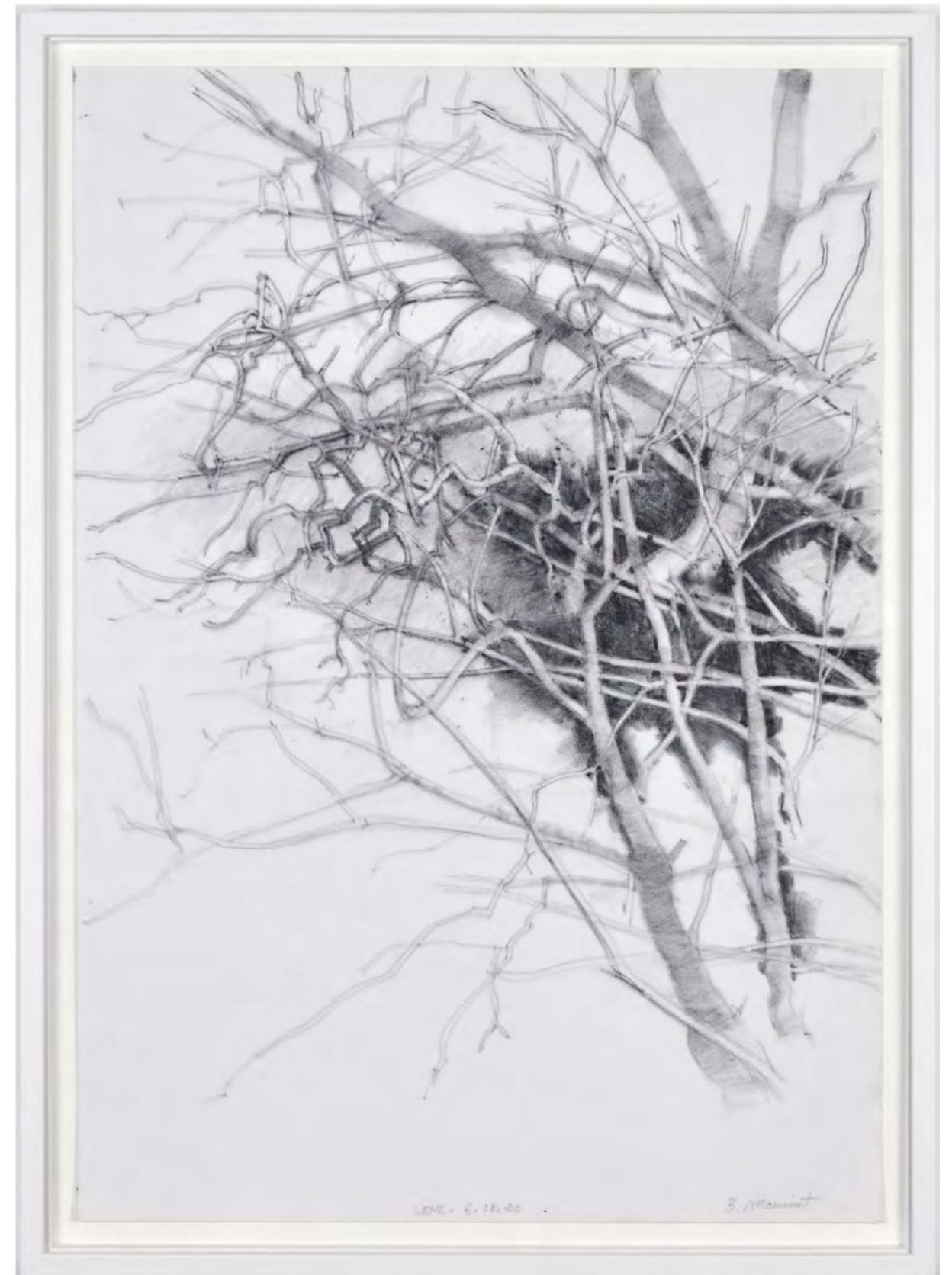
Bernard Moninot Lenz (6.08.22), 2022, graphite on velvet paper, 50 x 35 cm