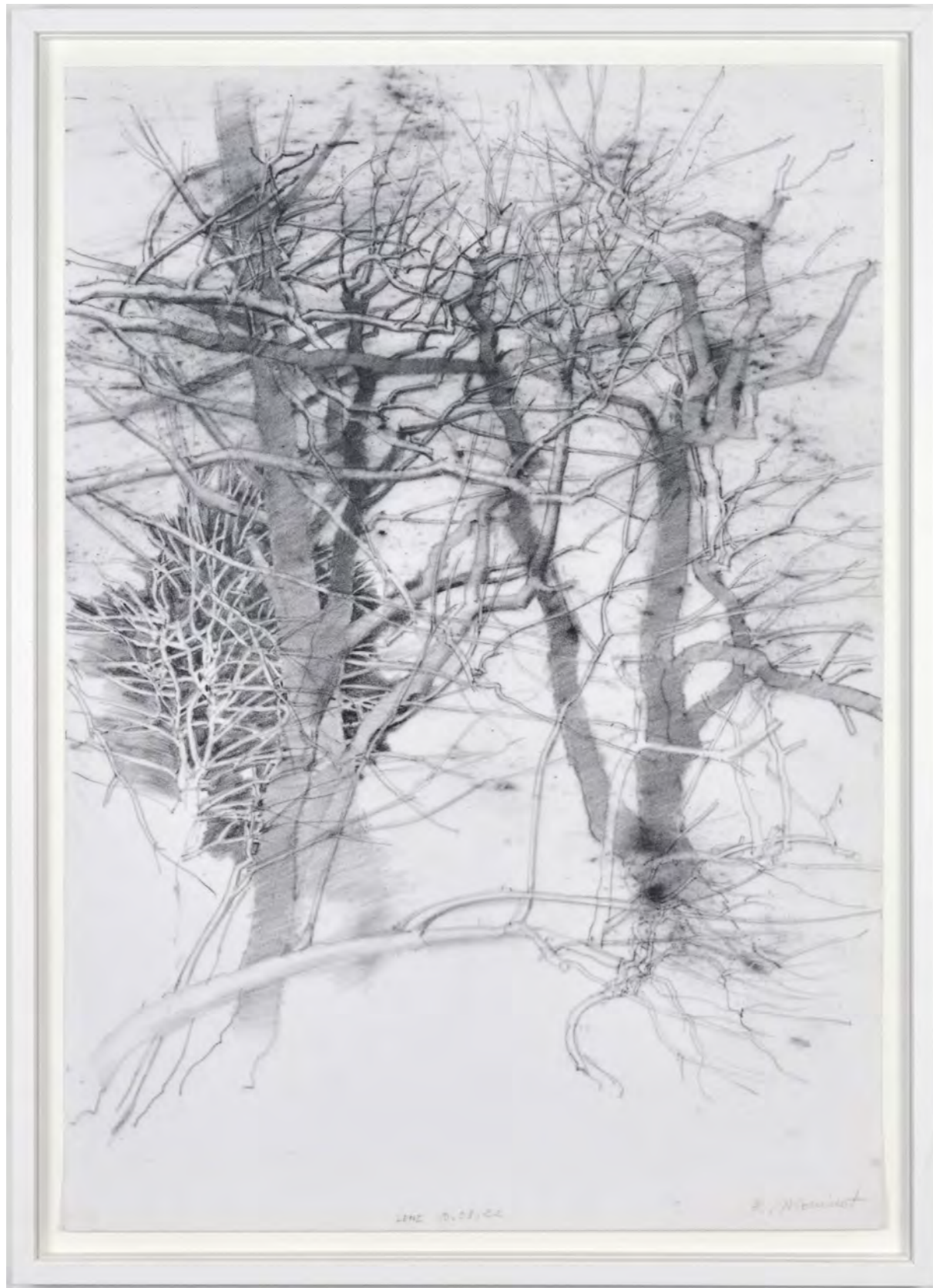
Bernard Moninot Lenz (10.08.22), 2022, graphite on velvet paper, 50 x 35 cm