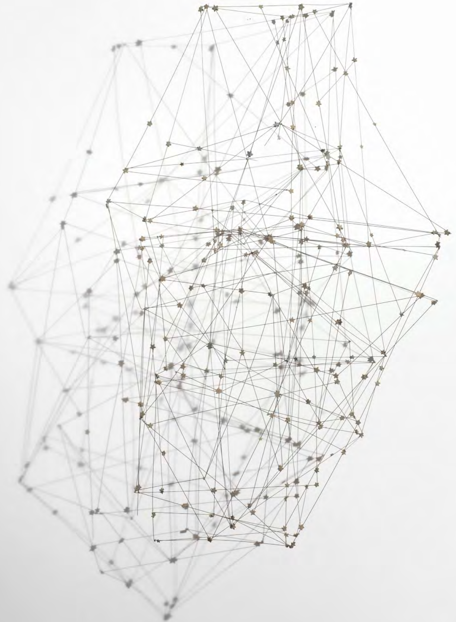
Bernard Moninot Lumière fossile , 2019 | welded piano strings and collage of pentacrines | 72 x 30 x 36 cm