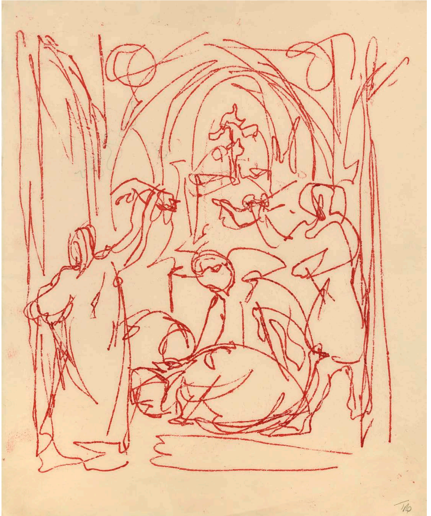
Gérard Traquandi Sans titre , 2023 | oil transfer | 50 x 32,5 cm