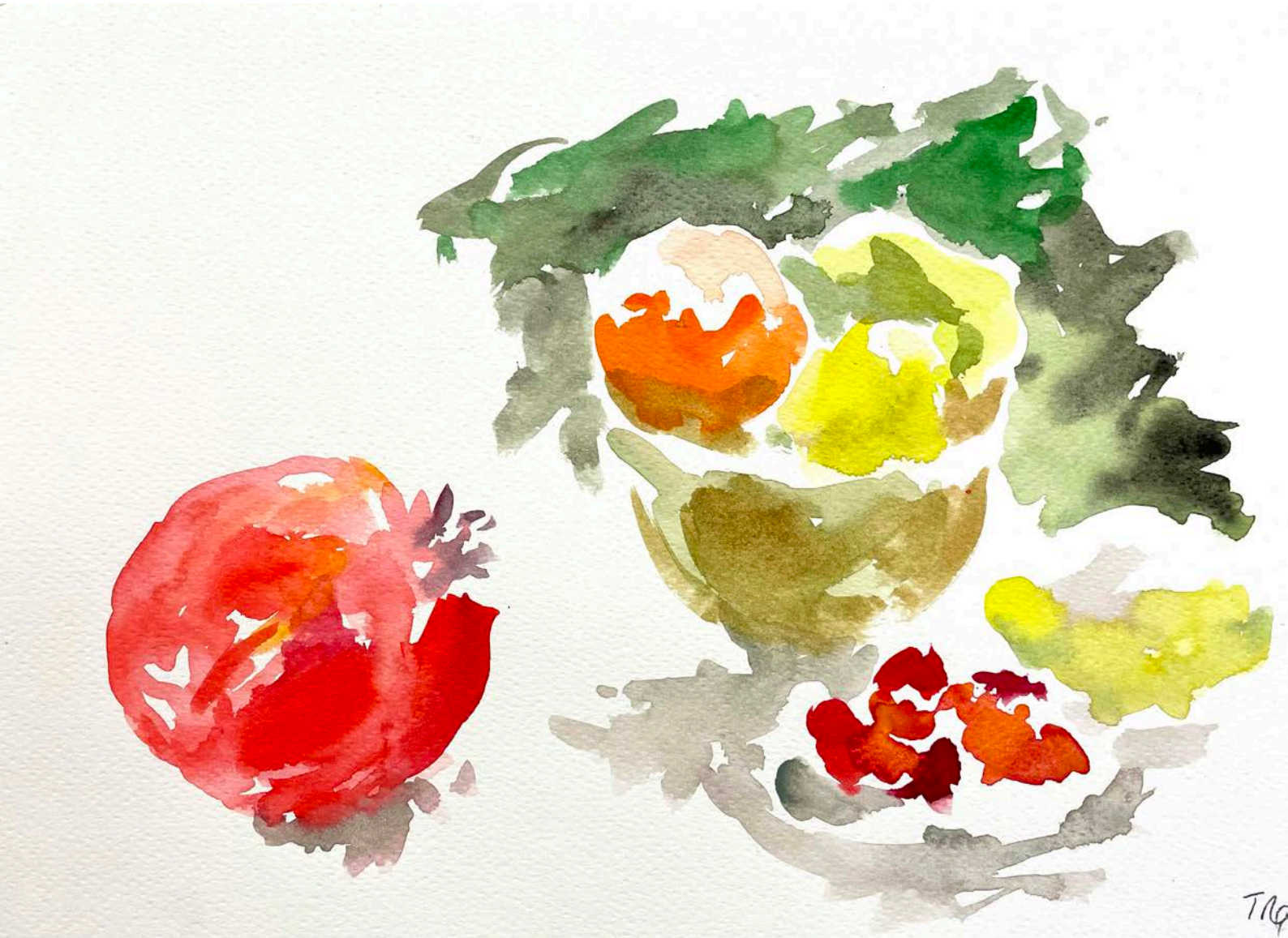
G rard Traquandi Untitled , 2023 | watercolour on paper | 25 x 37,7 cm