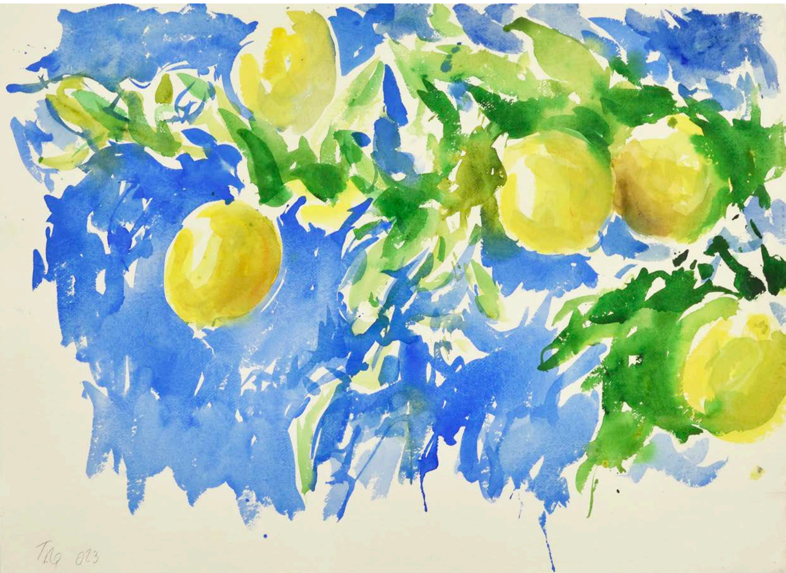
G rard Traquandi Sans titre , 2023 | watercolour on paper | 57,5 x 77 cm