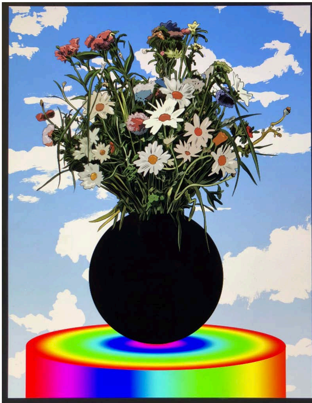
Ugo Bienvenu « Bouquet sur table arc-en-ciel », 2018 | digital print on carpet | 222 x 150 cm