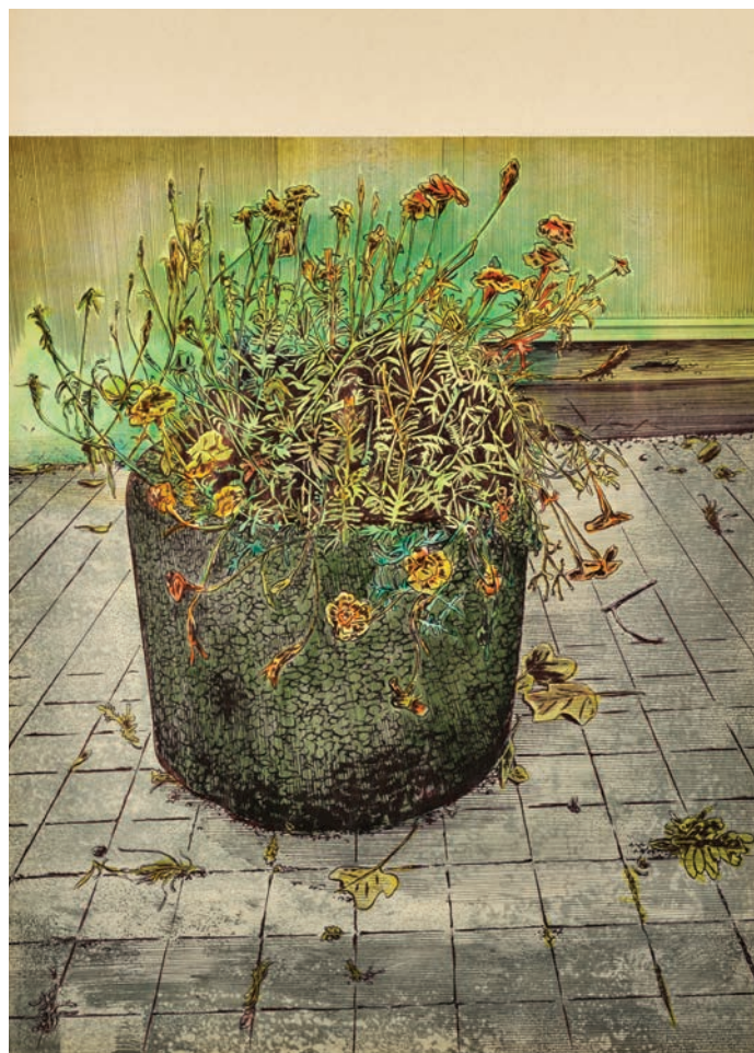
Frédéric Poincelet « Cristof Yvoré », 2018 ballpoint pen and color ink - 65 x 45 cm

40, rue Quincampoix 75004 Paris | 1 er étage T. +33 1 45 55 23 06 | Du mardi au samedi de 14 à 19 heures et sur rendez-vous contact@catherineputman.com | catherineputman.com