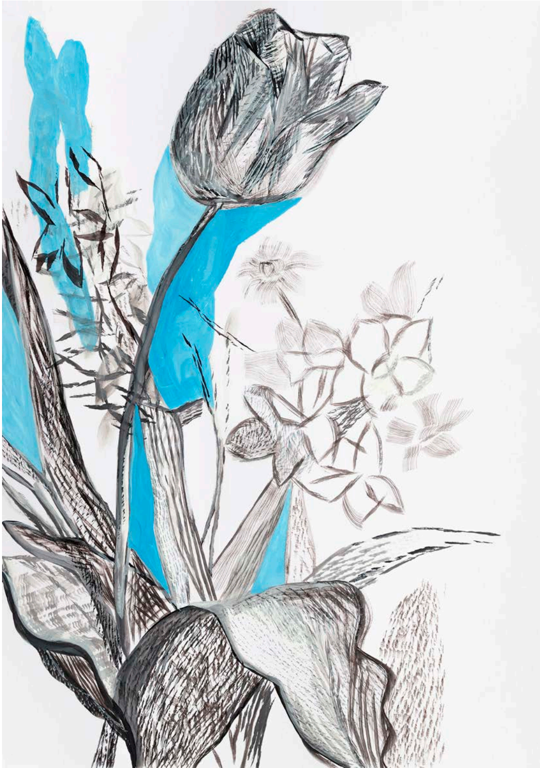
Marc Desgrandchamps « Untitled », 2018 | gouache on paper | 42 x 29,5 cm Copyright Marc Desgrandchamps | courtesy Galerie Lelong & Co