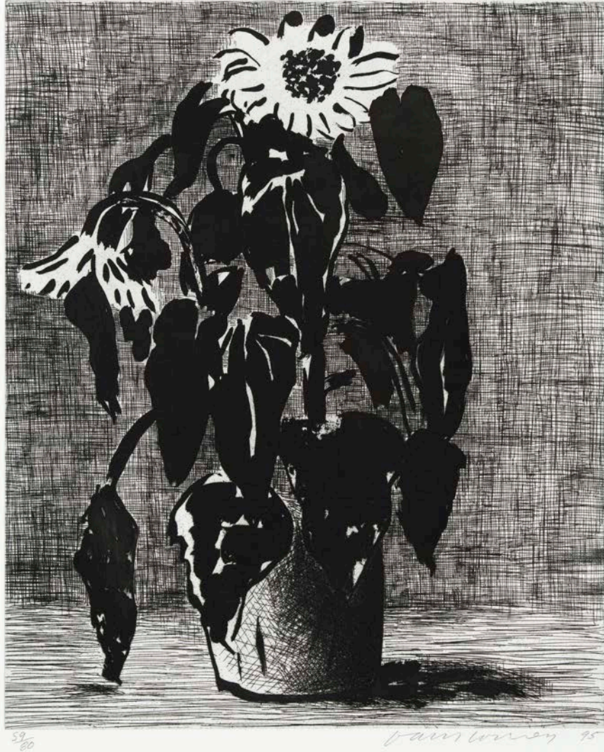
David Hockney « Sunflower I » (347), 1995 | etching 80 ex./Arches 69 x 57 cm