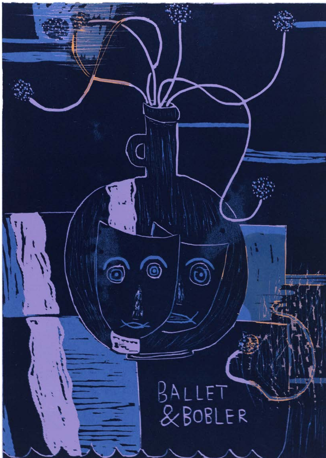
Tal R « Ballet & Bobler », 2018 | woodcut 95 ex. | 70 x 50 cm