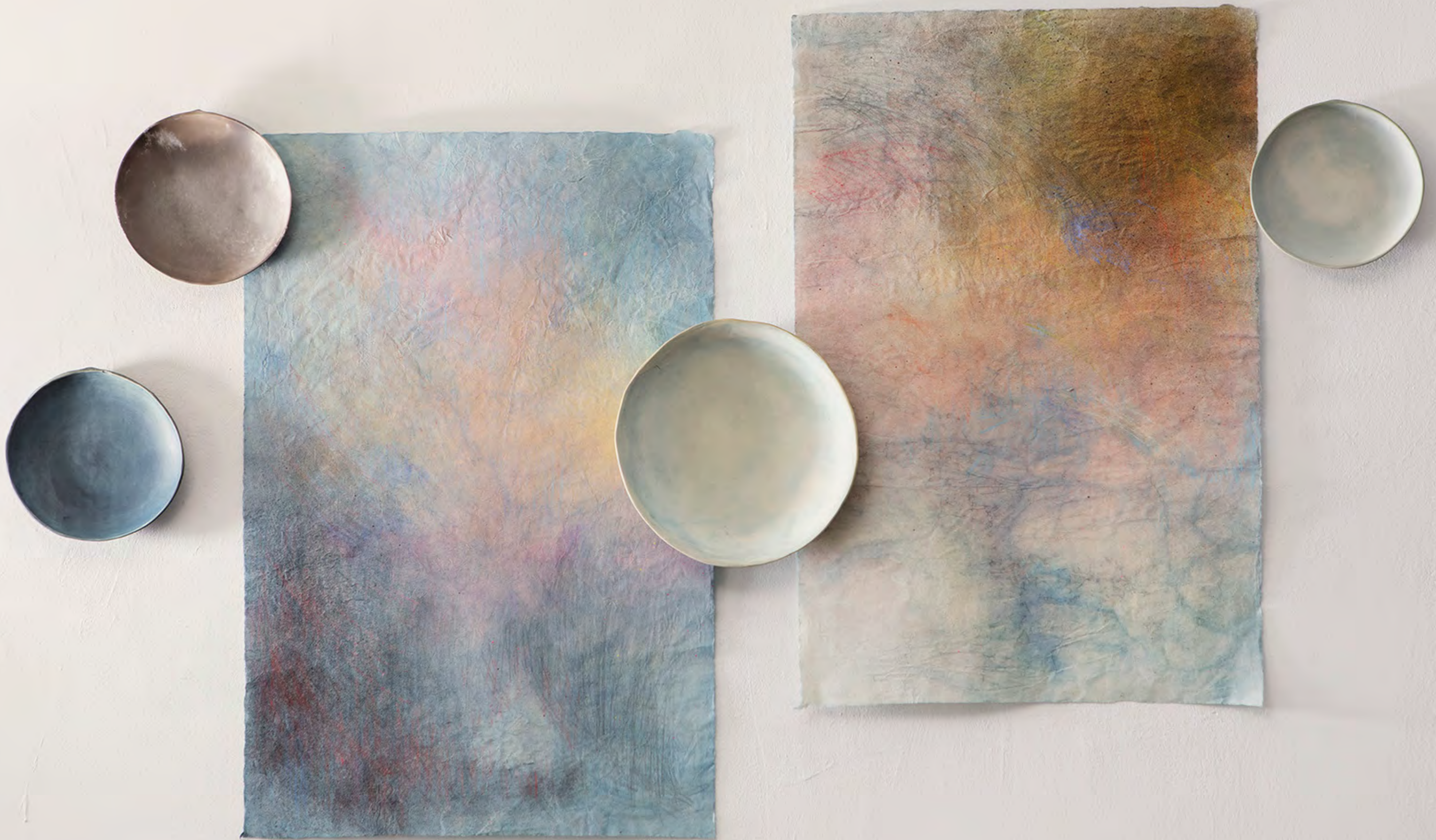
Eloïse Van der Heyden Calendrier 2020 - indigo-dyed or smoked ceramics - diam : 35 cm - 24 cm