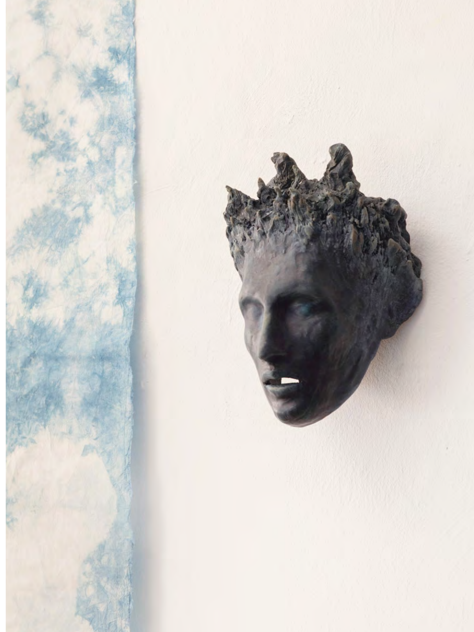
Eloïse Van der Heyden Eros 2020 - indigo-dyed ceramic - 32 x 20 cm

Corps singulier pluriels , Galerie Insula, Paris, France