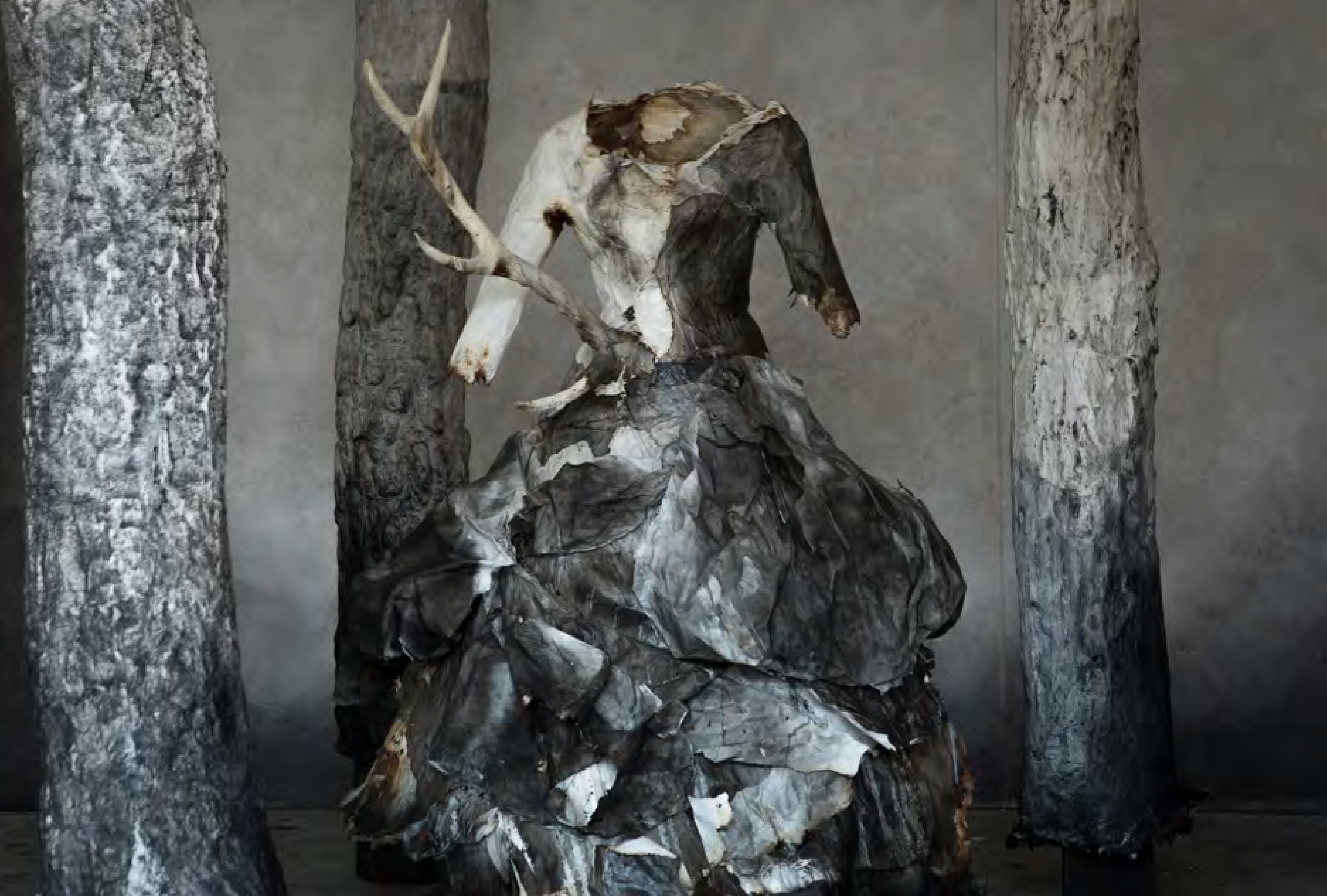
Eloïse Van der Heyden Sans titre 2021 -burnt and smoked papers - 140 x 100 cm