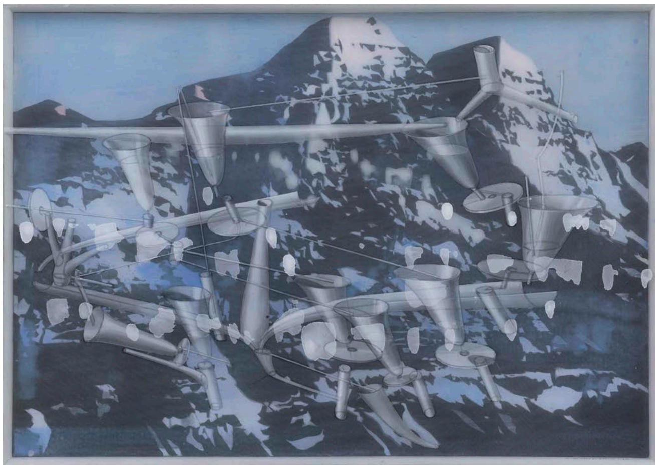
Bernard Moninot Prémonition de l'avalanche #6 , 2019 graphite and acrylic on paper mounted on wood and polyester silk canvas 31 x 43 x 2,5 cm