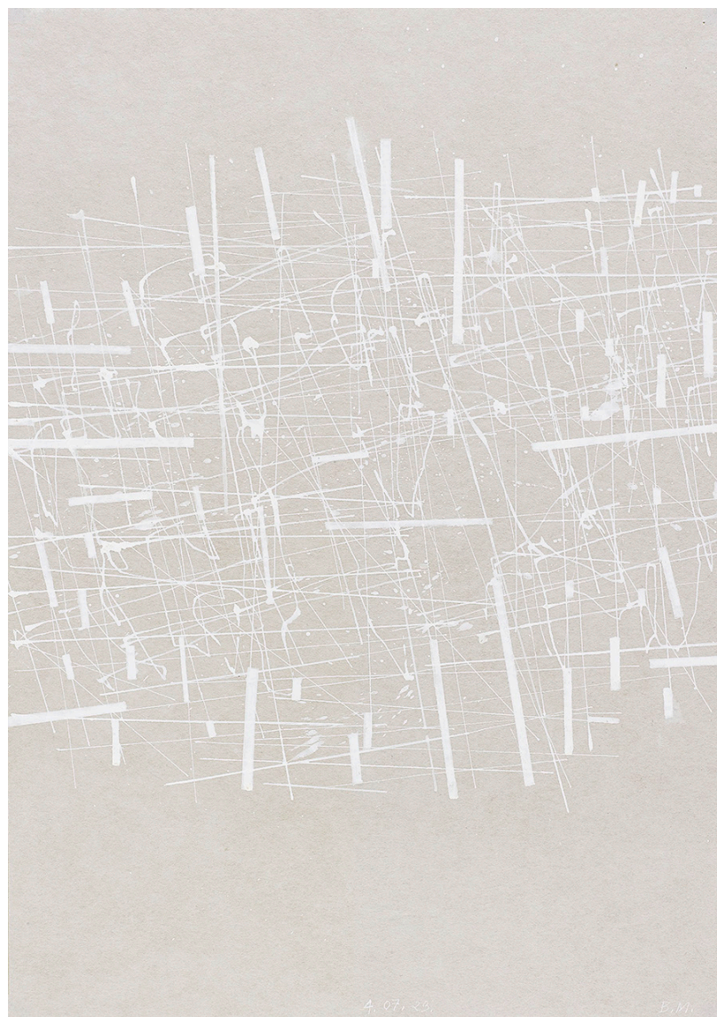
Bernard Moninot Tipp-Ex partitions (homage à Pascal Dusapin) , 2023 acrylic and Tipp-Ex on Japan paper treated with gel medium 45 x 32 cm