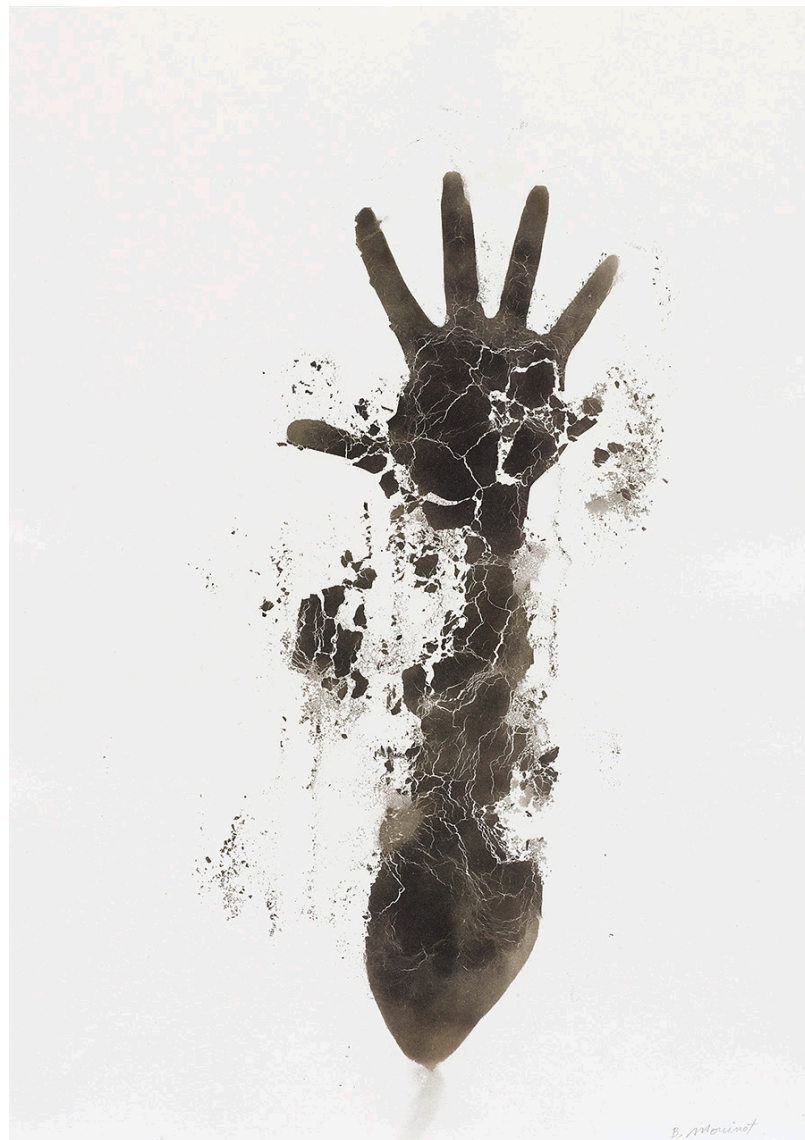
Bernard Moninot Suite ukrainienne n° 2 , 2023 Acetylene smoke on paper fixed with Lascaux fixative 42 x 29,5 cm