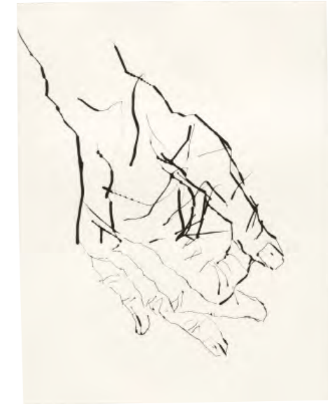
Georges Baselitz Eine Hand ist keine Faust , 2019 | A series of 12 etchings with sugar lift, aquatint and dry point | 53,7 x 39,4 cm | Edition of 12