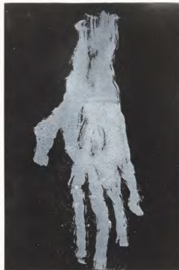
Georges Baselitz Mano VI (white) , 2019 | aquatint 78 x 53, cm | Edition of 12