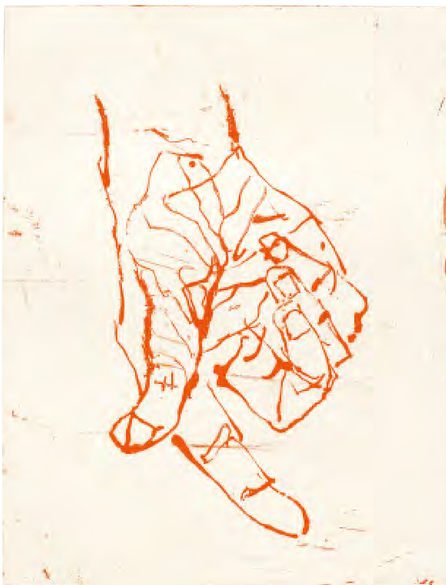
Georges Baselitz Eine Hand ist keine Faust IV , 2019 | etching and aquatint 53,7 x 39,4 cm | Edition of 12

40, rue Quincampoix 75004 Paris | 1 er étage T. +33 1 45 55 23 06 | Du mardi au samedi de 14 à 19 heures et sur rendez-vous contact@catherineputman.com | catherineputman.com