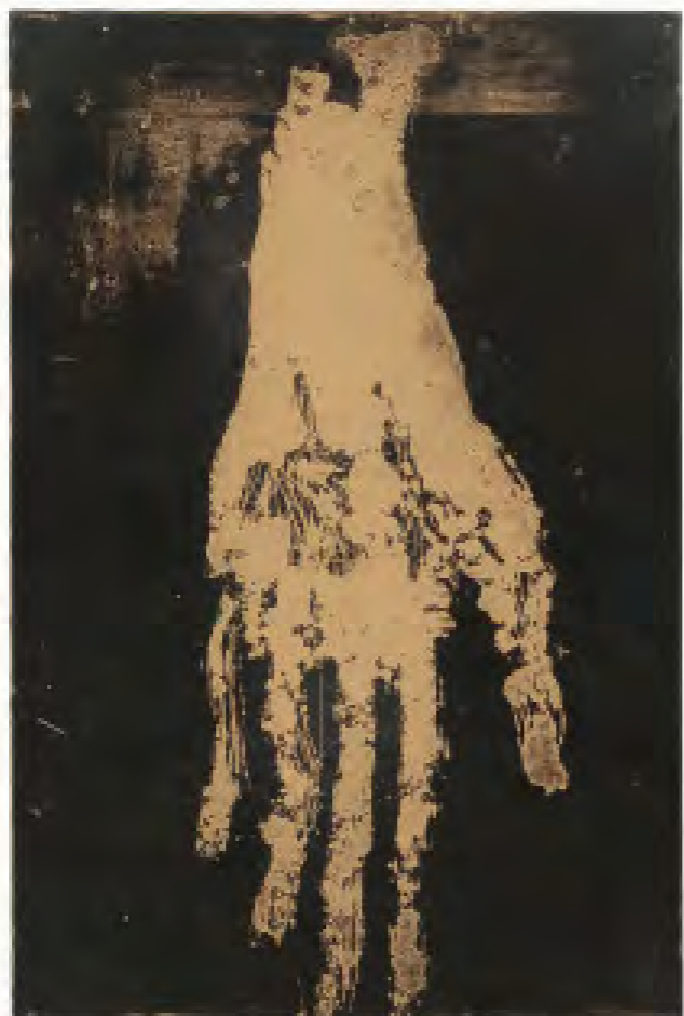
Georges Baselitz Mano II (gold) , 2019 | aquatint 78 x 53, cm | Edition of 12 ex.