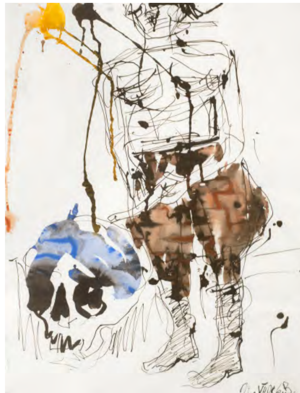
Georges Baselitz Big Night (Remix) 14.VII.08, 2008 | watercolour and China ink 65,8 x 50,6 cm

Finally comes the naked body, female or male, his own, ageing and represented with no concessions. The inversion of the figure that has been almost systematic since 1969 also allows him to keep a distance from the body and depict members that are like entire elements floating in space.