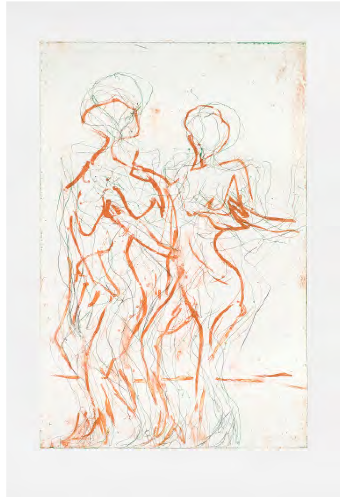
Georges Baselitz Sing Sang BDM II , 2012 | etching 147,5 x 99 cm | Edition of 20 (in 2 colours)

Georg Baselitz, in Grabados Gravures Prints 1964-1990, Cabinet des estampes, Genève - Ivam, Valence - Tate Gallery, Londres, 1991.