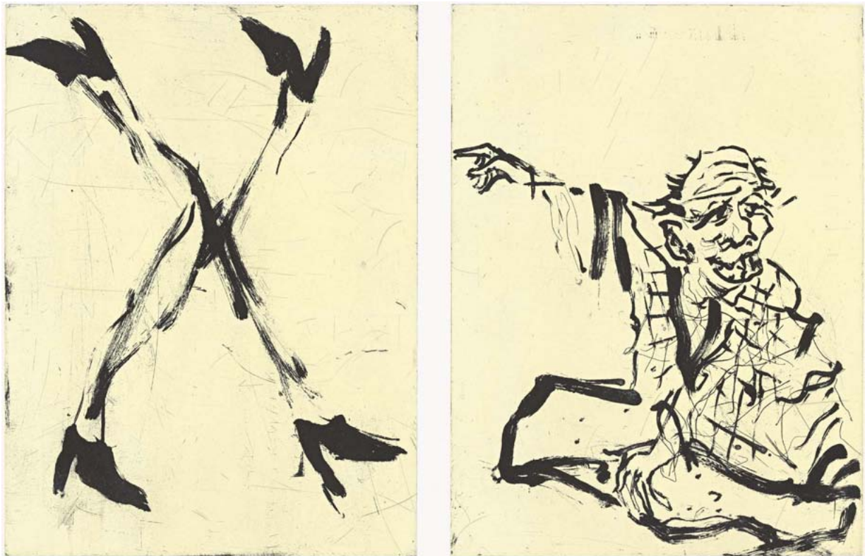
Georg Baselitz "Besuch von Hokusai I" [Visit of Hokusai I], 2015 etching and aquatint in black (4 plates), on Somerset 85,5 x 118,5 cm | 10 proofs