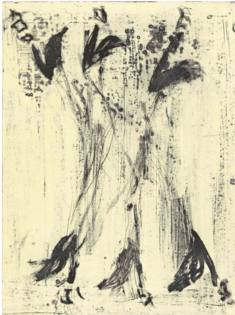
Georg Baselitz "Ich höre Stimmen" [I hear voices], 2015 etching and aquatint in black (2 plates) on Somerset | 85,5 x 64,5 cm

At the occasion of edition of new engravings by Georg Baselitz , Besuch von Hokusai , 2015 and Ich höre Stimmen , 2015 the Gallery Catherine Putman is pleased to present «Pied à terre», an exhibition of the artist's prints dating from 1995 to 2015. The gallery edits his works for 20 years.