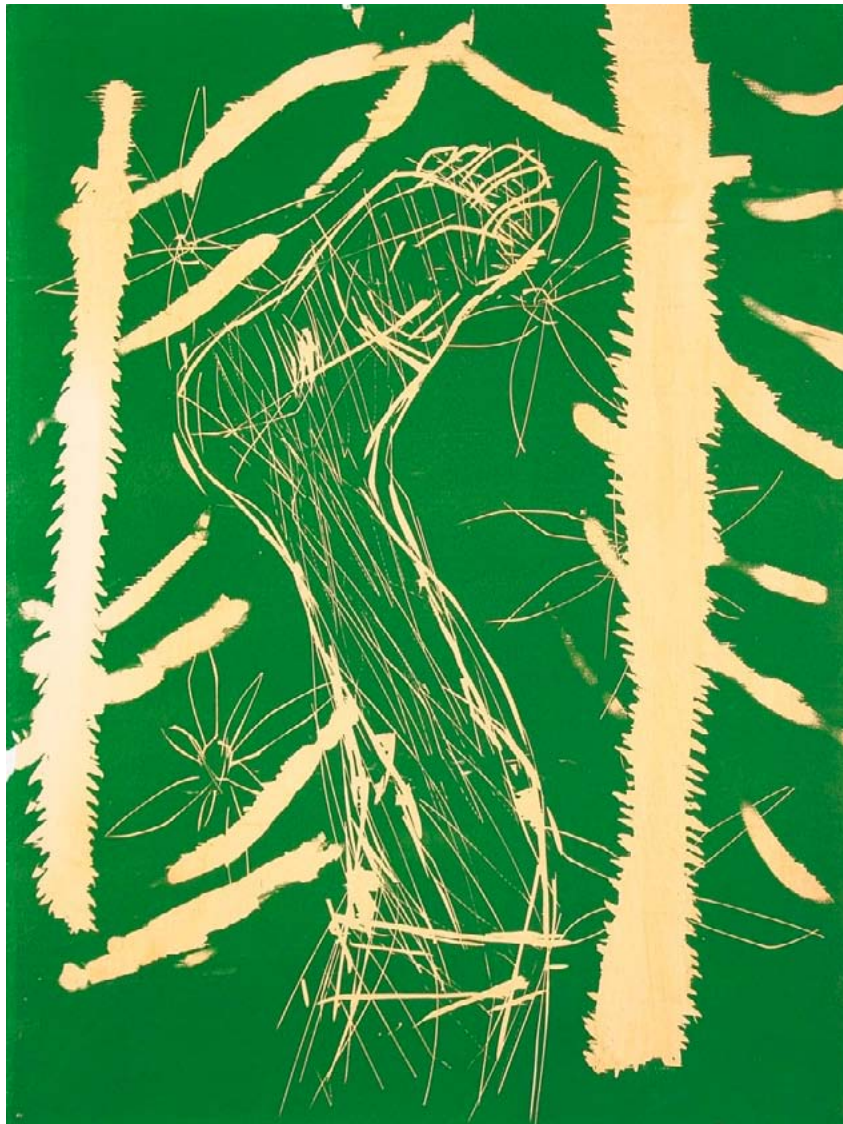
Georg Baselitz "Waldfuß" [Forestry foot], 1996 - 1997 Woodcut, on Japan Hosho 69 x 82 cm | 12 proofs