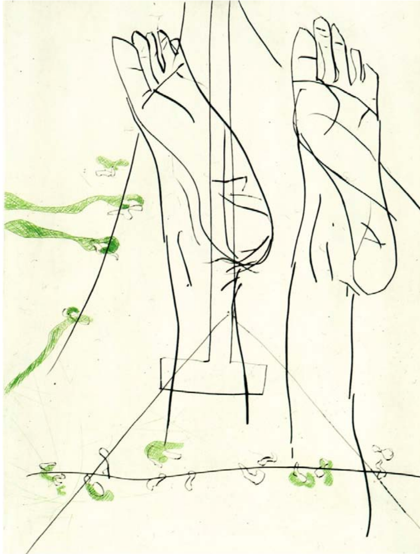
Georg Baselitz "Zelt" [Tent], 1995 - 1996 dry point in colour (2 plates), on BFK Rives 80 x 60 cm | 12 proofs