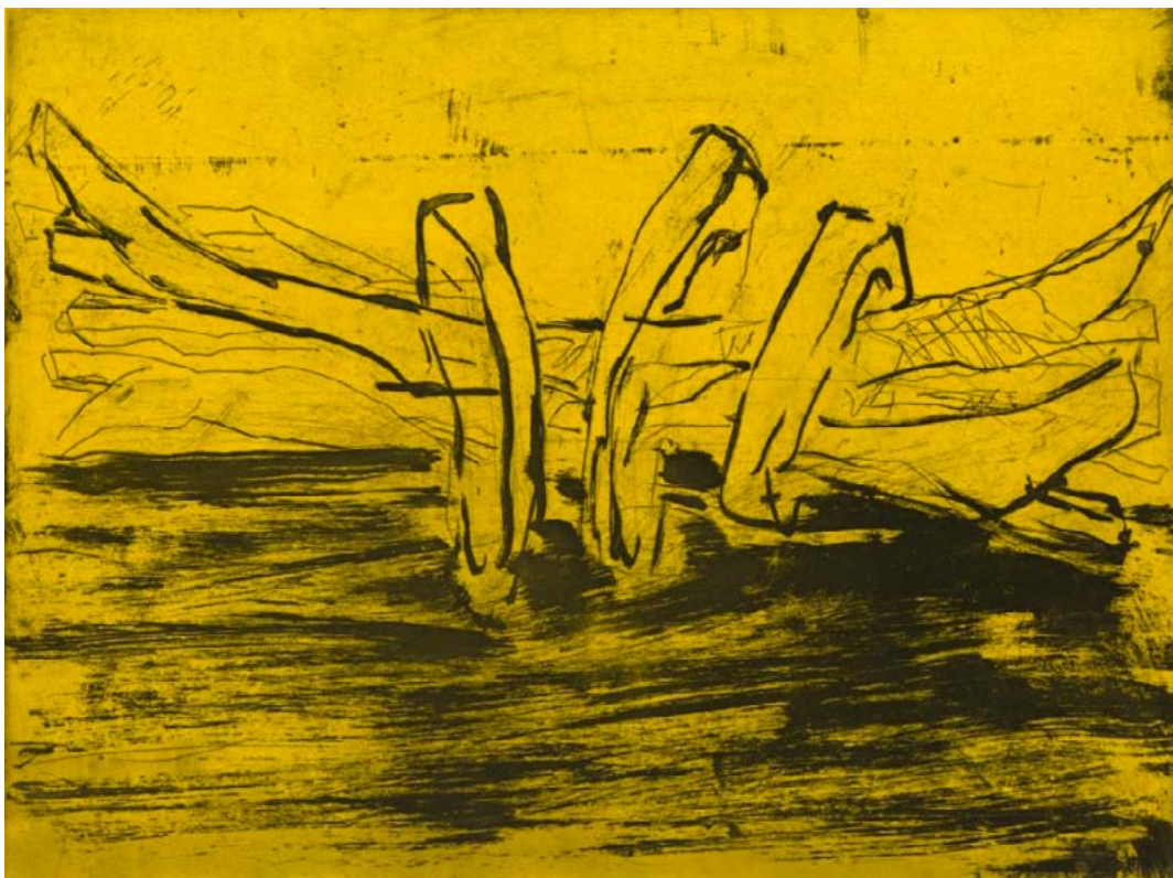
Georg Baselitz "Winterschlaf X" [Hibernation X], 2014 etching and aquatint, in black on yellow background (2 plates), on Somerset 69 x 82 cm | 10 proofs