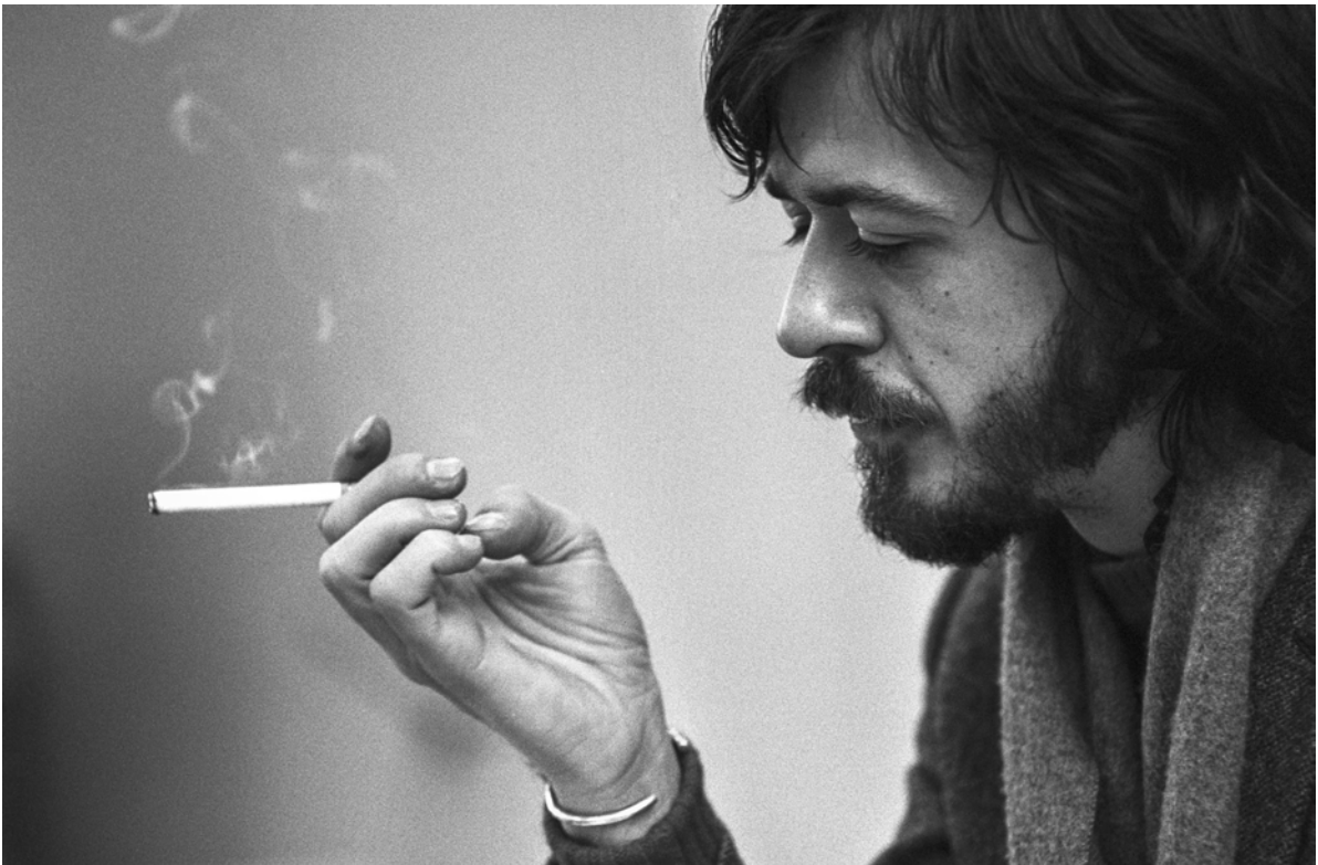
Rajak Ohanian «Patrice Chéreau» inkjet print on Hahnemuhle paper | 30 x 40 cm | © Rajak Ohanian