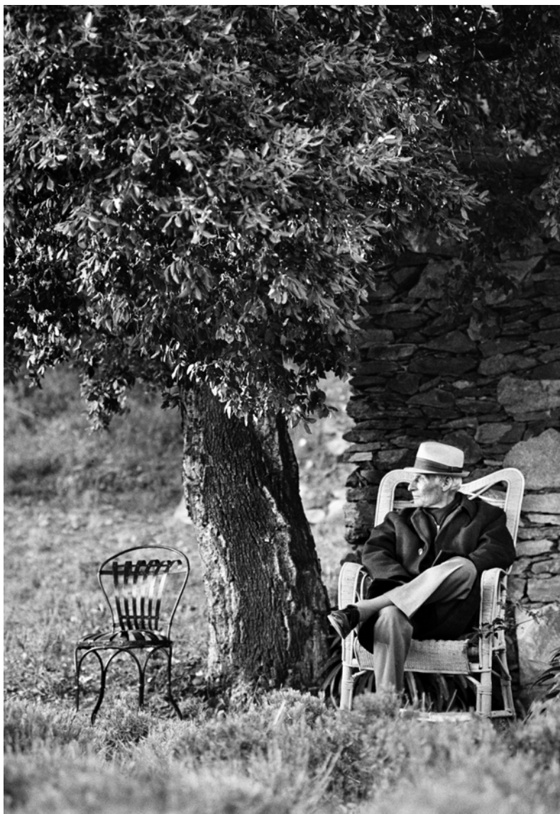
Rajak Ohanian, planche du portfolio «Bram van Velde», 2016 inkjet print on Hahnemuhle paper | 40 x 30 cm | 15 ex. | © Rajak Ohanian

40, rue Quincampoix 75004 Paris | 1 er étage T. +33 1 45 55 23 06 | Du mardi au samedi de 14 à 19 heures et sur rendez-vous contact@catherineputman.com | catherineputman.com