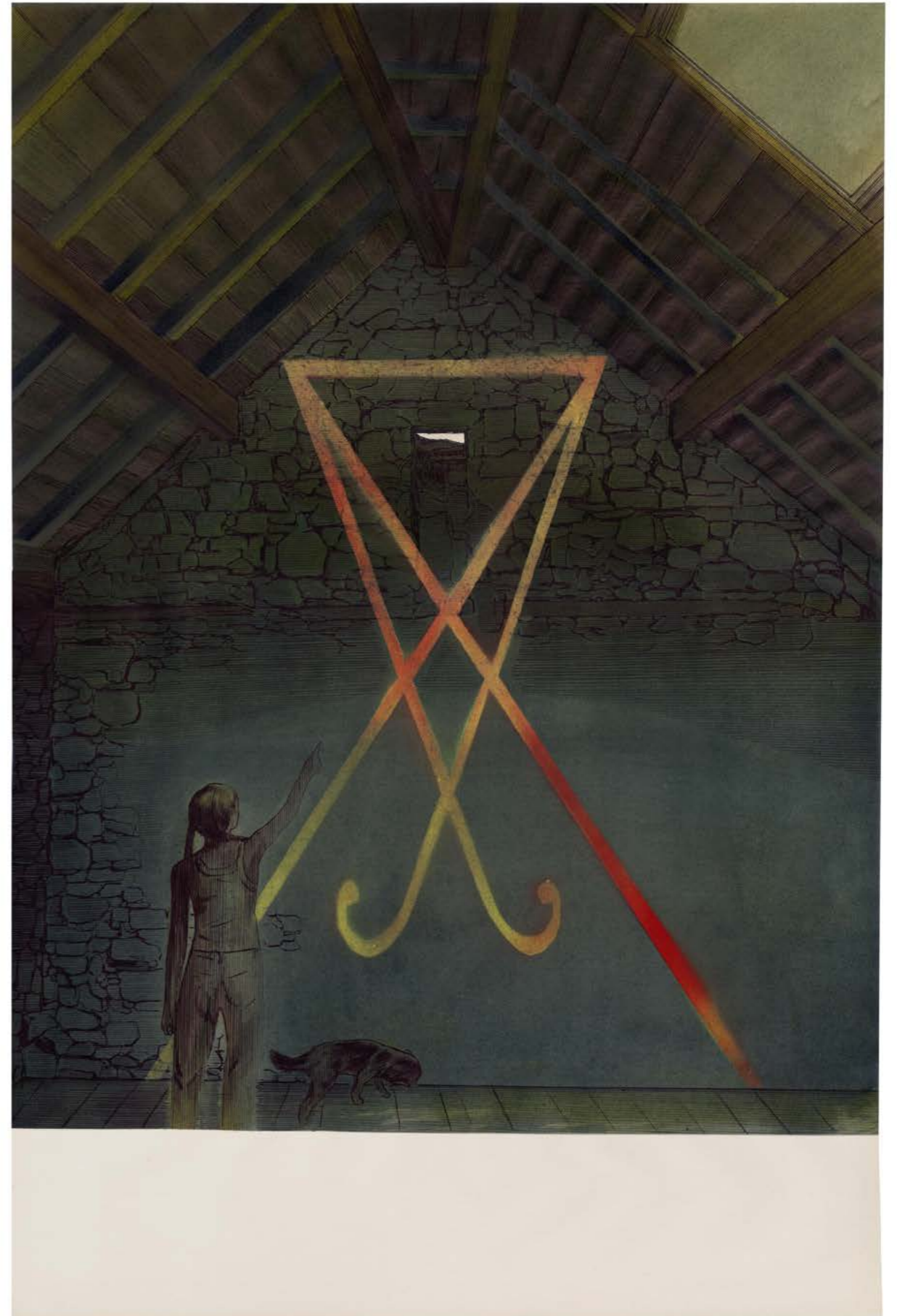
Frédéric Poincelet Sans titre (Le Satan) , 2023 | ballpoint pen, color ink and aerosol painting on paper | 100 x 70 cm

«Hors d'oeuvre», La Pomme de Discorde «Un père pas très compréhensif», S2 l'art