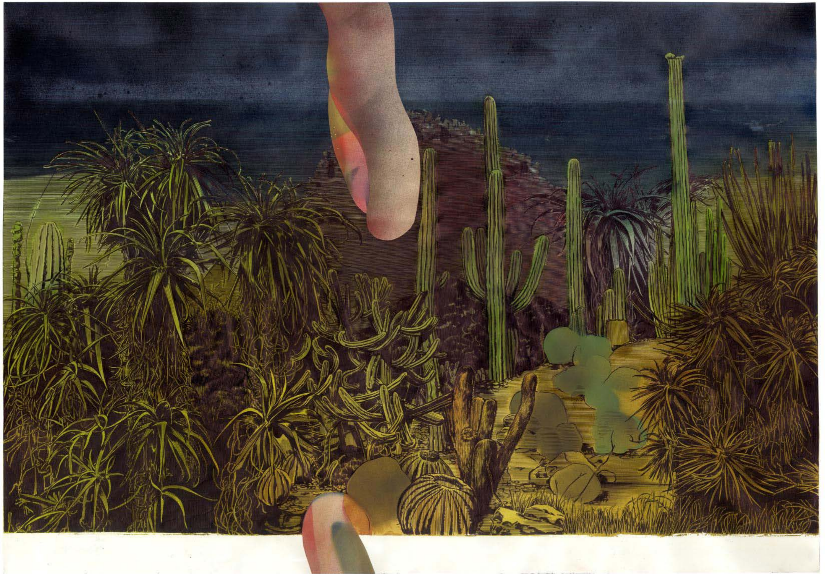
Frédéric Poincelet Sans titre (Le Satan) , 2022 | ballpoint pen, color ink and aerosol painting on paper | 75 x 100 cm